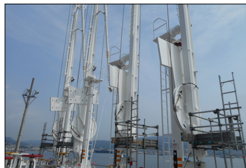
Overhauled MLAs in Sasebo, Japan

The Recurring Maintenance and Minor Repair Program provides , maintenance, inspections, repairs and emergency response actions for DLA capitalized petroleum facilities, other DOD activities and other federal activities on military installations worldwide, in compliance with federal, state, and local code, criteria and regulations.