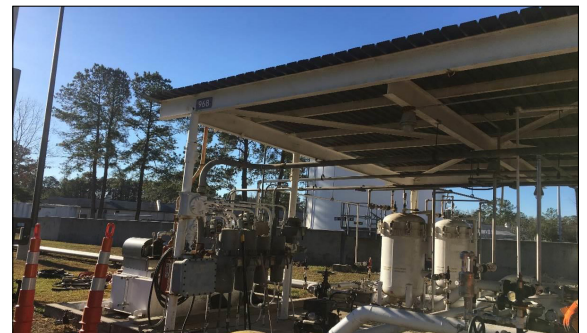
Before photo of a maintenance project