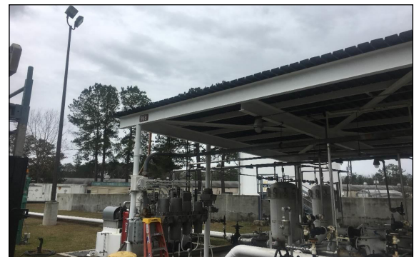
After photo of the maintenance project